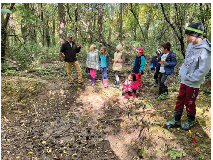
Exploring animal tracks in the mud pit.