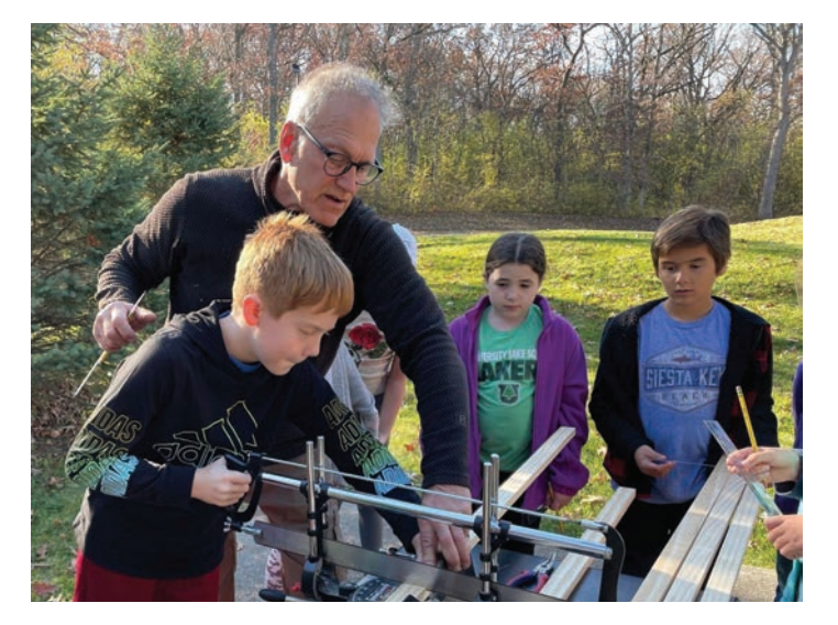
Making birdhouses to study Wisconsin wildlife by birdwatching.