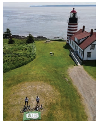
Mike and Quinn show their true colors at the West Quoddy Head Lighthouse in Lubec, Maine, the end point of their trek.

in less than 24 hours. Quinn's ascent was 152 miles in 13.5 hours. Hawk Hill was considered. but it would have taken over 350 laps versus the 192 at Lapham. This past September, Quinn completed a 202 mile ride from Lower Nemahbin Lake to Ephraim, WI in 10.5 hours. Next up? Quinn and Mike plan to bring brother Pete along for the Scottish Highlands' North Coast 500, a 516 mile scenic route beginning and ending at Inverness Castle in May of 2023. They'll also include the Isle of Skye loop. Sky's the limit!